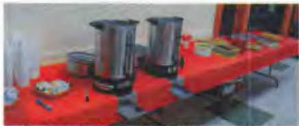
Coffee & dessert table in snack area