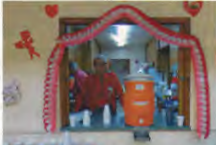
Pass-through from kitchen to dance hall