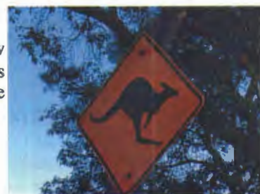
Our 1st 'Roo?

On the way home we saw our first wild Kangaroos – proof that we were driving in Australia!