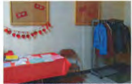
Vestibule; flyer table, coat rack, sign-in table (not shown)