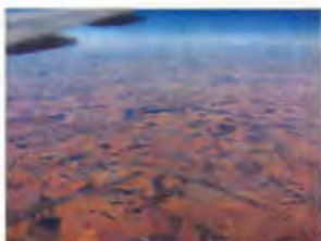
Our first view of Australia – The wheat fields

Then we boarded another Air New Zealand flight, this one seven hours to Perth, Australia. Another smooth flight, another nice hot dinner with wine, and arrival on time in Perth. Our good luck continued as our baggage also arrived and our Avis rental car was ready.