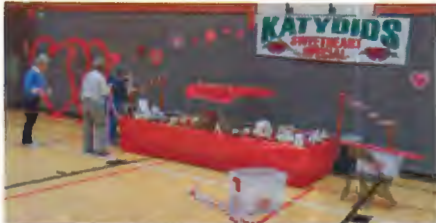
Stage; eventually centered under banner.