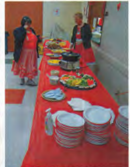
Food table in snack room