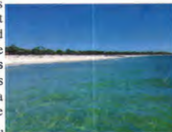
Our 1st beach – Busselton

The beaches were gorgeous – lots of white sand, bright blue ocean and not a loud in the sky. Very few people at the beach but then it was midweek. Temperatures around 90 degrees and a light breeze. We drove through varied terrain, some hilly areas, some tree-lined areas, and a lot of arid land.