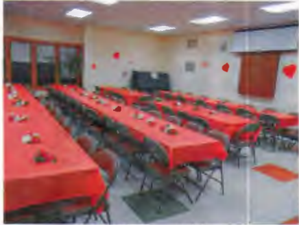
Snack area tables