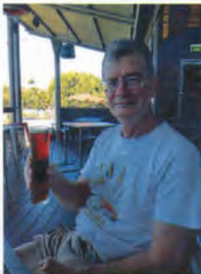
Australian Beer #1