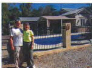
Our 1st night in Australia

After 48 hours of travel, we opted to settle in for the night at the Rothwood B&B only 10 minutes from the airport.