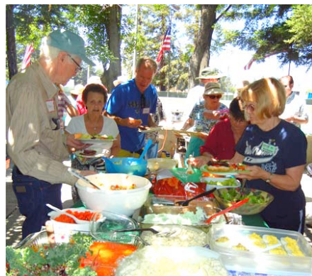
Come and get it!