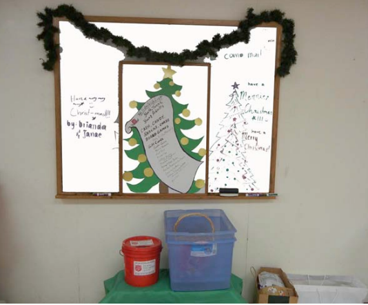
Salvation Army's wish list.