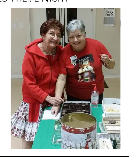
December 19, 2014 HOLIDAY SPIRIT THEME NIGHT