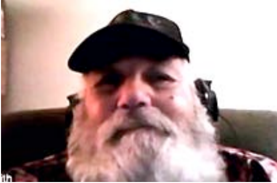
5 March 2021 Zoom while in San Jose