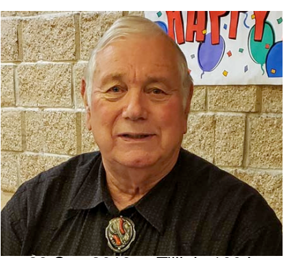
28 Sep 2019 at Tillie's 100th birthday party