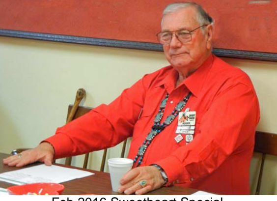
Feb 2016 Sweetheart Special