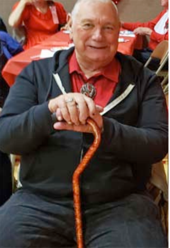
Feb. 2019 Sweetheart Special