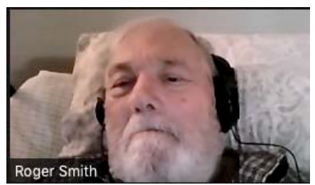
6 August 2021 Zoom, while in, Eastvale