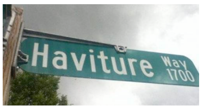
Interesting sign; "Have it your Way"