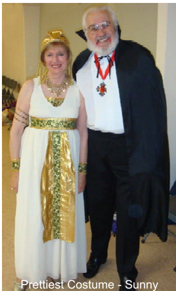
Prettiest Costume - Sunny