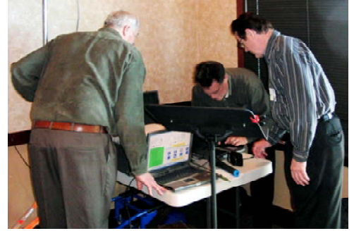
Electronic wizards hard at work