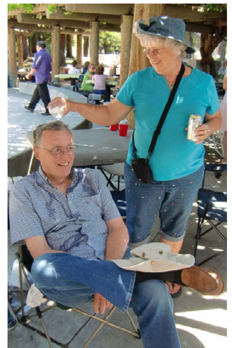
A perfectly 'cool' way to end a lovely day!