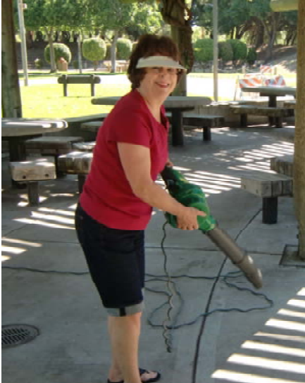
The answer my friend, is blowin' in the wind ...