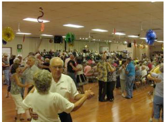
And then of course there is the Polka Jam starting at 8:00 in the morning!!!! With a 20+ piece band!