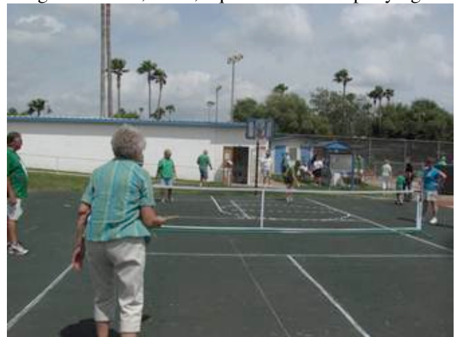
Pickleball was a new addition at the park this year. Lots of interest and participation during the St. Patrick's Day games.