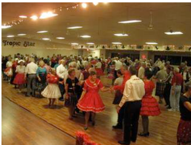
A good turnout for the Sweetheart Ball Square Dance. Best dance floor in "the Valley" – best caller and callers, too!