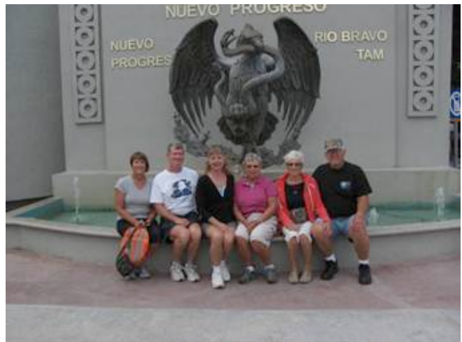
Why be in the Rio Grande Valley if you're not going to Mexico? We go carefully to Nuevo Progresso – midday, in groups and sticking to the main street – but we go. Dentists, meds, liquor and a bit of partying.