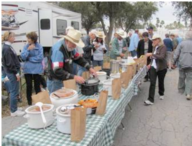
The chili cook-off is always a great treat – 18 entries this year and all tasted wonderful.